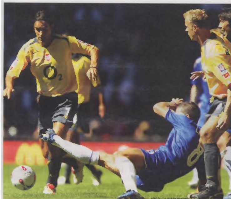
PFA members will benefit as record keeping becomes more efficient

'The upgrade will allow us to do more with our databases – and specifically to record information about grants and courses,' he said.